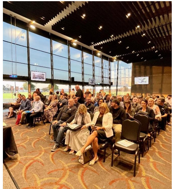
BIZLINK AGM 18 October 2022, at Tompkins on Swan